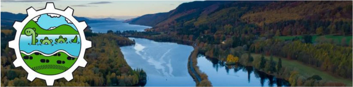
LOCH NESS HUB

Walker transfers accounted for 1.03 Tonnes of CO2 This equates to approximately 2 kg of CO2 per walker Currently 25% of our fleet is zero emission in use